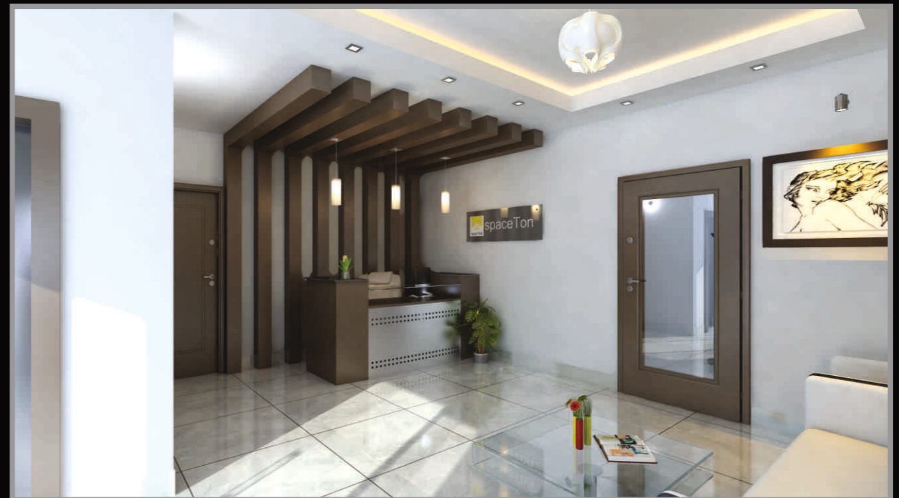
Aesthetically designed reception area