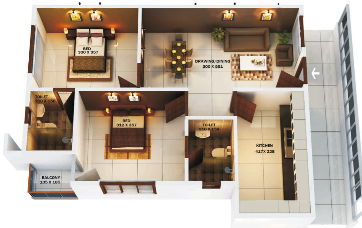
FLAT B 917sqft