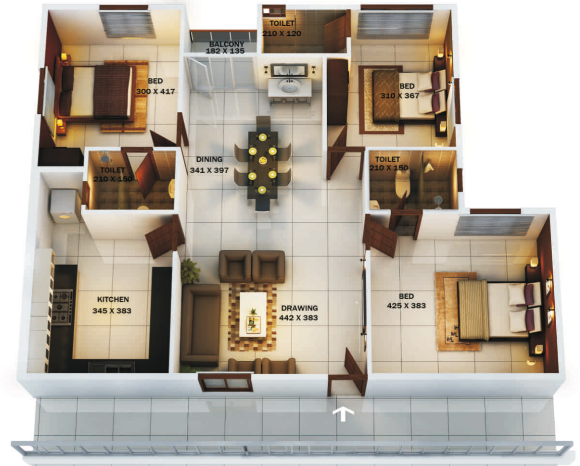
FLAT C 1527sqft