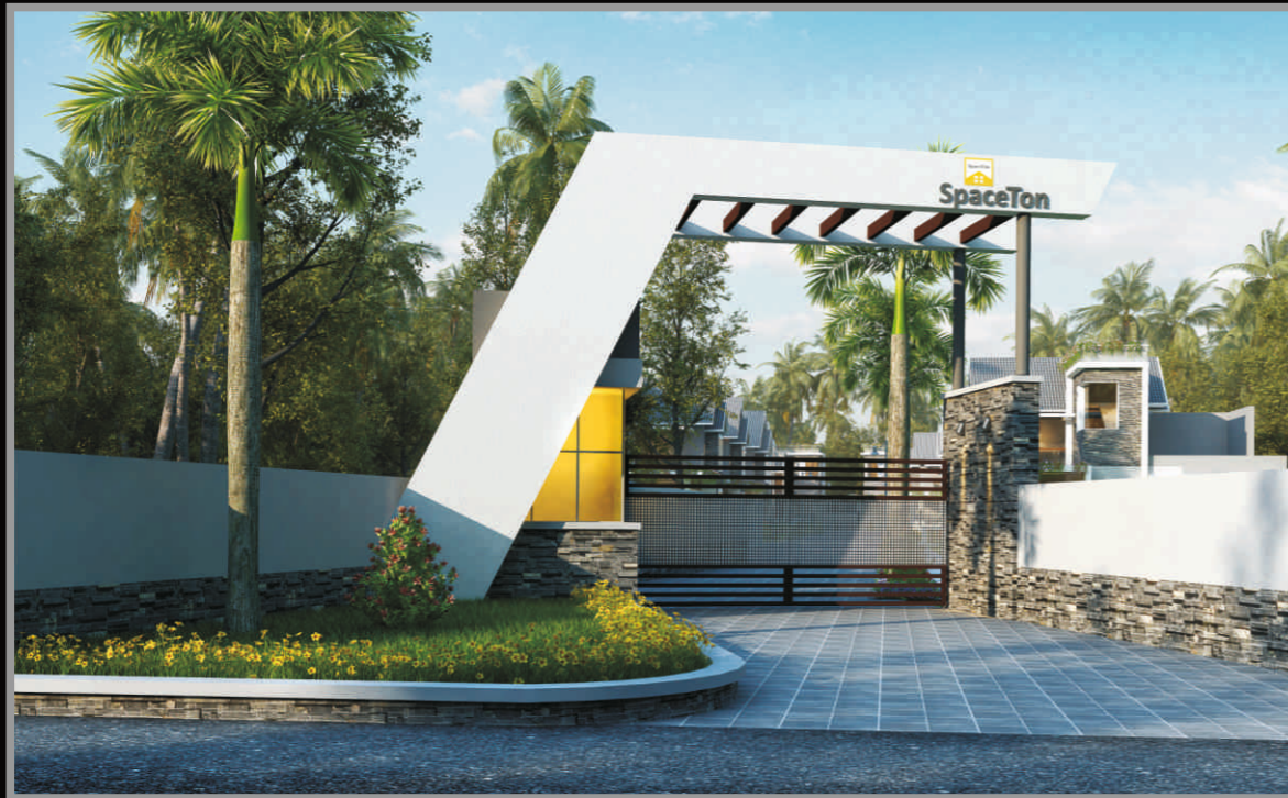
Entrance plaza with security kiosk

For warm welcomes and lingering goodbyes