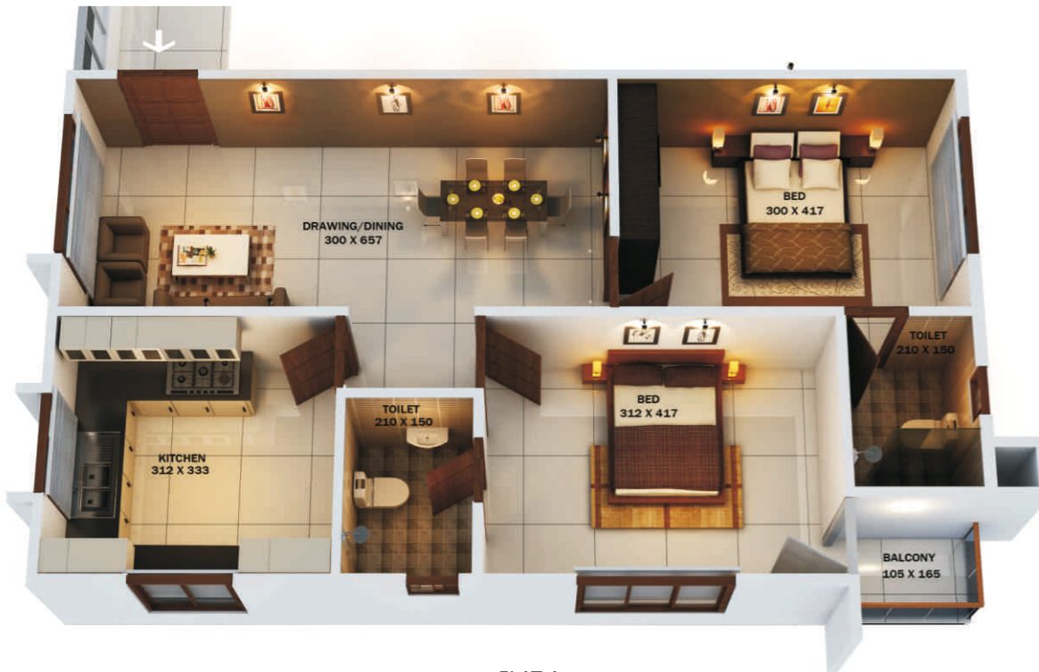
FLAT A 1035sqft